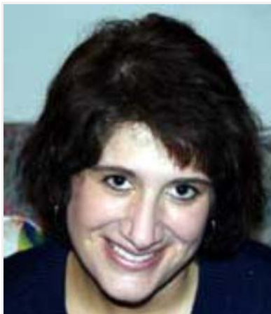
The Gainesville Community Supported Agriculture program can help you stay healthy this year.

Another new addition, Blue Ridge Mountain Creamery and Fruit Company , now occupies the former Maggie Moo's space and offers visitors an array of delicious and healthy treats.